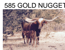
585 GOLD NUGGET