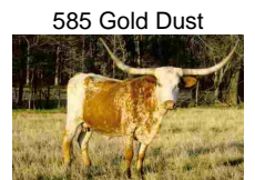
585 Gold Dust