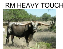
RM HEAVY TOUCH