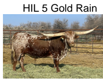
HIL 5 Gold Rain