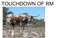
TOUCHDOWN OF RM