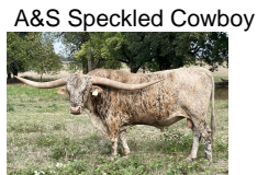
A&S Speckled Cowboy