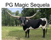
PG Magic Sequela